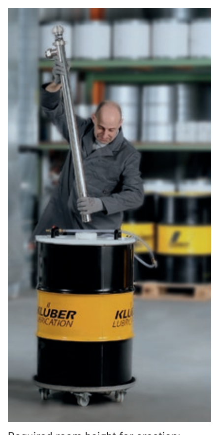
Required room height for erection: Approx. 86.6" (2200 mm), without motor