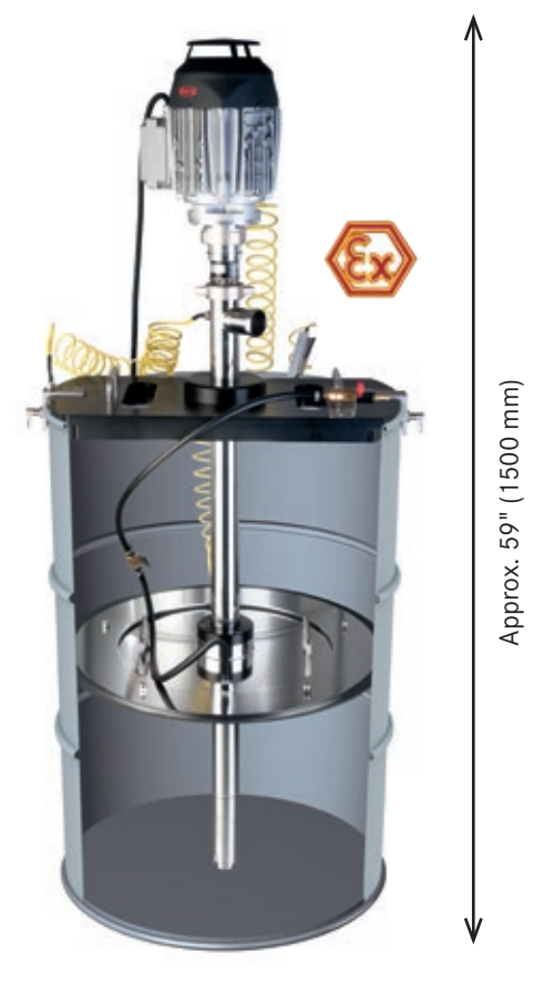
System height assembled (dependent on pump version and motor)